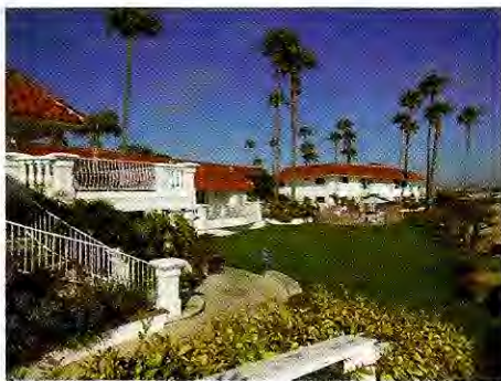
Oceanside Marina Suites in Oceanside, California, site of the 2013 Golden State Chimney Sweep Guild convention.

The convention covered a wide array of subjects pertaining to the chimney industry and specifically to California. Subjects ranged from technical to business, but also included fun times with